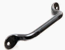
Hand Forged 4" Long Black