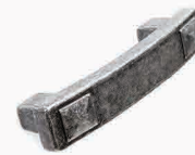
Amerock 44-28-WI 4 1/8" Long