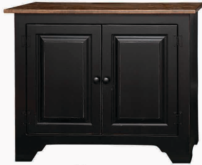
#33 Cabinet 37" w x 13 1/4" d x 30" h Double Doors Base: Black Paint Top: Special Walnut Stain