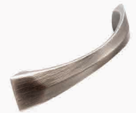
Jeffrey Alexander 595-96 BN BDL 4 3/4" Long Weathered Nickel