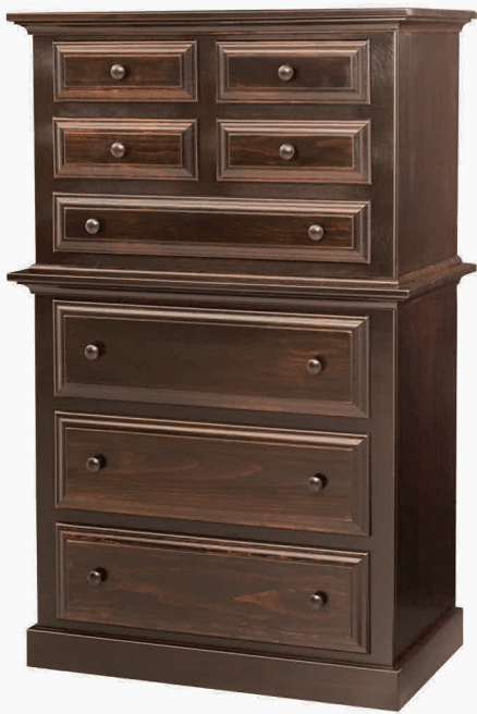
#54 Chest on Chest 35½" w x 21" d x 57½" h (8) Drawers* Kona Stain