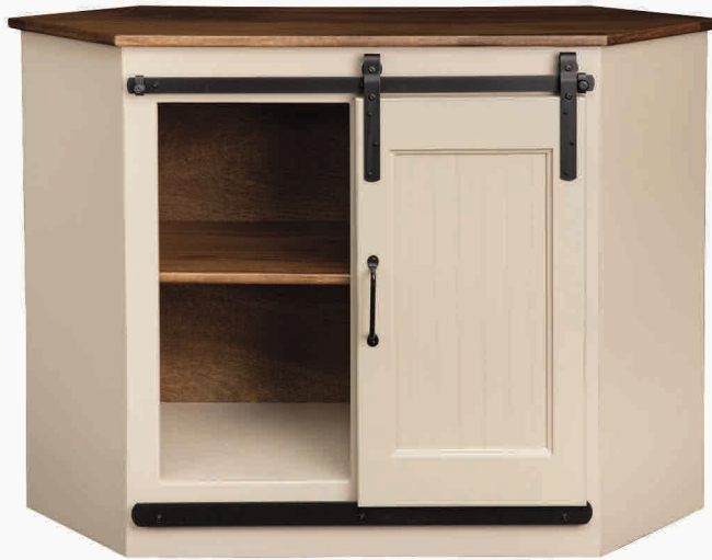
#103B Corner TV Cabinet 47" 47" w x 16" d x 33" h (2) Barn Doors, Adjustable Shelves Base: Sandy Buff Paint Top: Special Walnut Stain