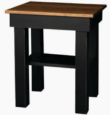
#4 End Table 20" w x 23" d x 26" h Post Legs Base: Black Paint Top: Special Walnut Stain