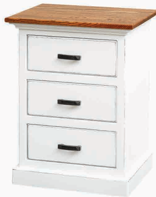
#44 Nightstand 22½" w x 14½" d x 30" h (3) Flush Drawers* Amerock Hardware 44-28-WI Base: Pure White Paint Top: Ruff Oak Wood w/ Special Walnut Stain