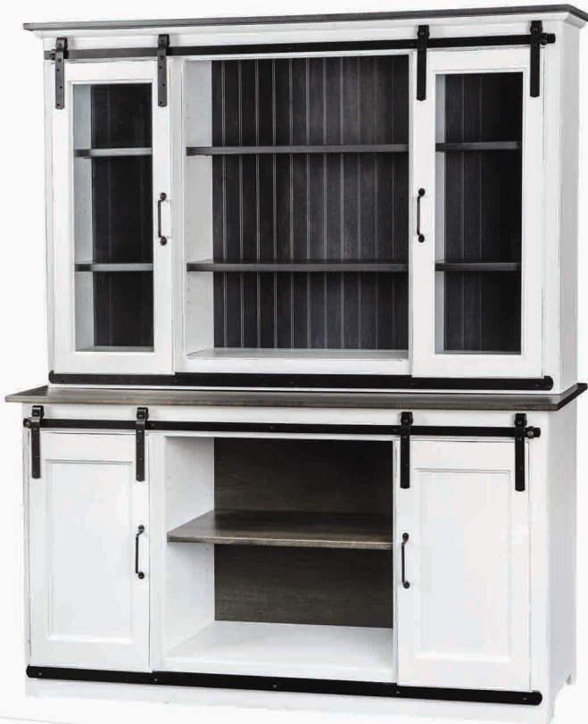
#309WGB Barn Door Hutch 60" w x 16" d x 73" h Wood & Glass Doors, Adjustable Shelves Pure White Paint & Antique Slate Stain