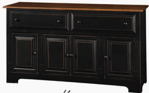
#135WD 60" Hutch Base, Wood Doors 60" w x 16" d x 33" h Base: Black Paint, Top: Special Walnut Stain