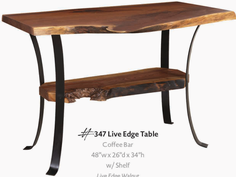
#347 Live Edge Table Coffee Bar 48" w x 26" d x 34" h w/ Shelf Live Edge Walnut