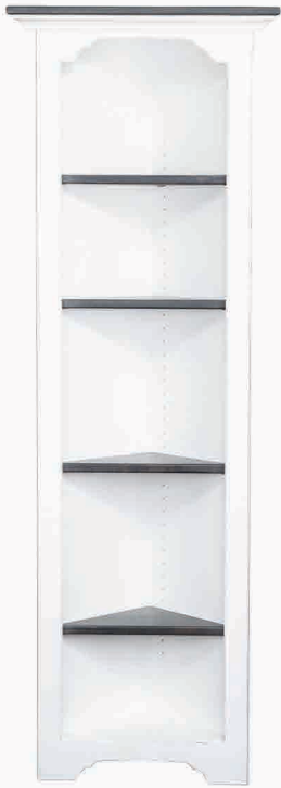
#180 Corner Cabinet 24" w x 12" d x 71" h Open, Adjustable Shelves Base: Pure White Paint Top: Antique Slate Stain