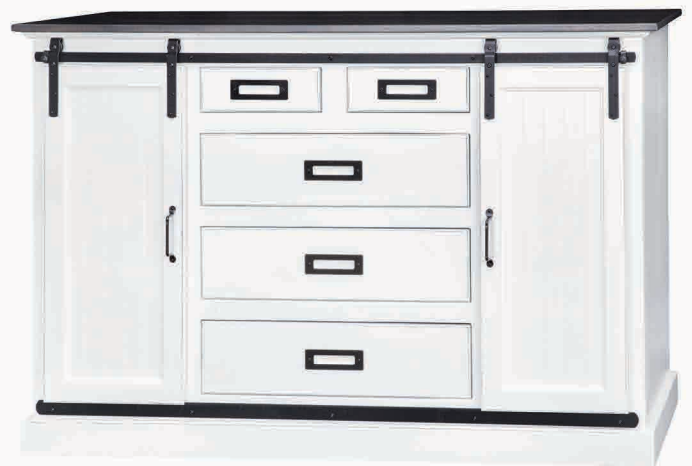
#31B Barn Door Dresser Cabinet 64½" w x 21" d x 42½" h (2) Doors, (5) Drawers*, Adjustable Shelves Can also be used as a server Base: Pure White Paint Top: Antique Slate Stain