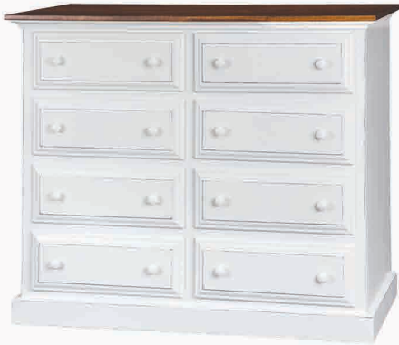
#7 Dresser 52" w x 21" d x 43" h (8) Drawers* Base: Dove White Paint, Top: Special Walnut Stain