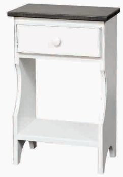
#56 Nightstand 15½" w x 9½" d x 24" h Single Drawer* Base: Pure White Paint Top: Antique Slate Stain