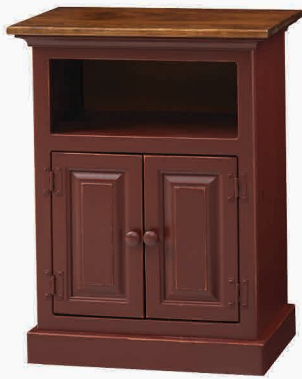
#35 Nightstand 22½" w x 14½" d x 30" h (2) Doors, Open Top Base: Burgundy Paint Top: Special Walnut Stain