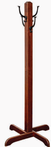
#202 Clothes Tree 51" h Cherry Stain