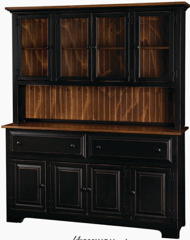
#309WG Hutch 60" w x 16" d x 73" h Wood & Glass Doors, Adjustable Shelves Black Paint & Special Walnut Stain