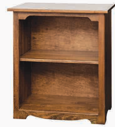
#60 Bookcase 26½" w x 13¼" d x 30" h Adjustable Shelves Special Walnut Stain