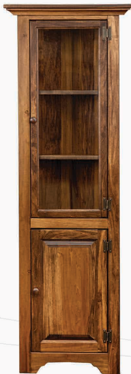
#181 Corner Cabinet 24" w x 12" d x 71" h Glass & Wood Door Adjustable Shelves Special Walnut Stain