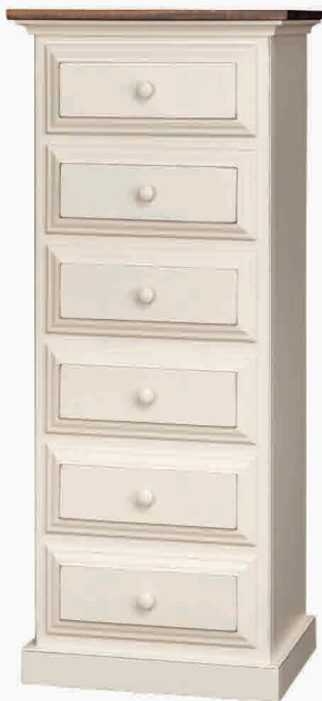
#45 Chest of Drawers 22½" w x 14½" d x 53¼" h (6) Drawers* Base: Cream Paint Top: Special Walnut Stain