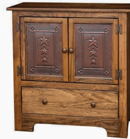
122TD - Tin Doors Special Walnut Stain