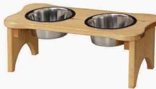
#89 Dog Dish 7" 2 Quart