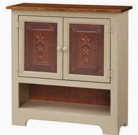
122TO - Tin Doors Open Shelf Base: Sandy Buff Paint Top: Special Walnut Stain