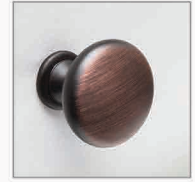
Elements 3910-DBAC Bronze