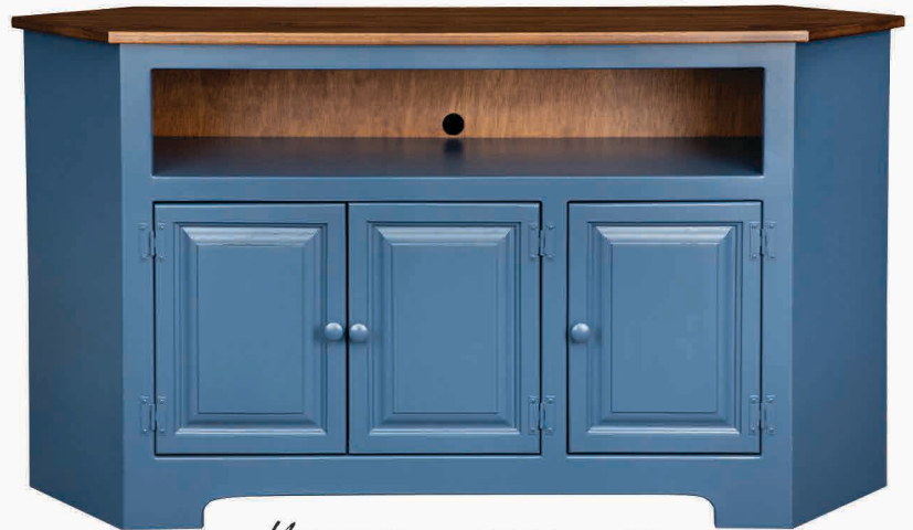
#104W Corner TV Cabinet 61" 61" w x 16" d x 33" h (3) Wood Doors Base: Navy Paint Top: Special Walnut Stain