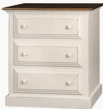
#58 Chest of Drawers 31" w x 21" d x 34" h (3) Drawers* Base: Cream Paint Top: Special Walnut Stain