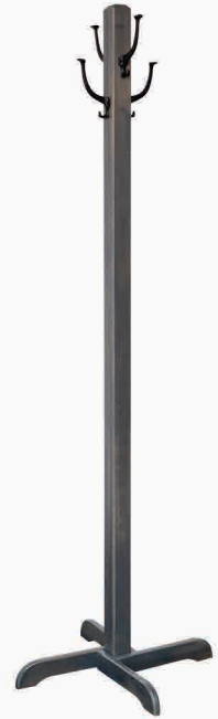
#201 Clothes Tree 69" h Pewter Stain