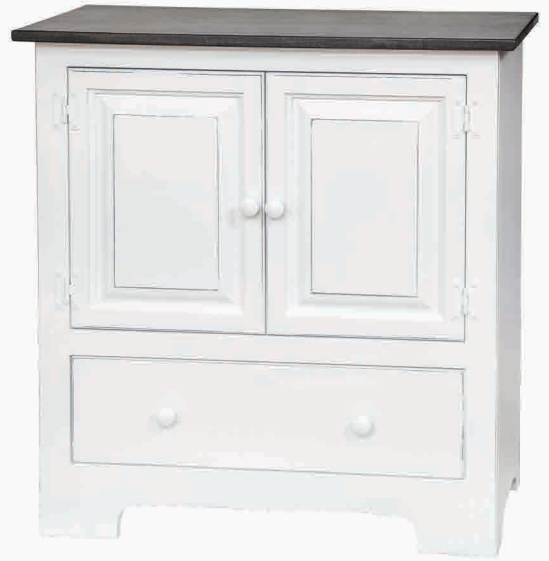
#122WD Double Hall Cabinet 32" w x 13 1/4" d x 33" h (2) Wood Doors, (1) Drawer Base: Pure White Paint Top: Antique Slate Stain