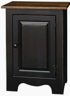
#32 Cabinet 22" w x 13 1/4" d x 30" h Single Door Base: Black Paint Top: Special Walnut Stain