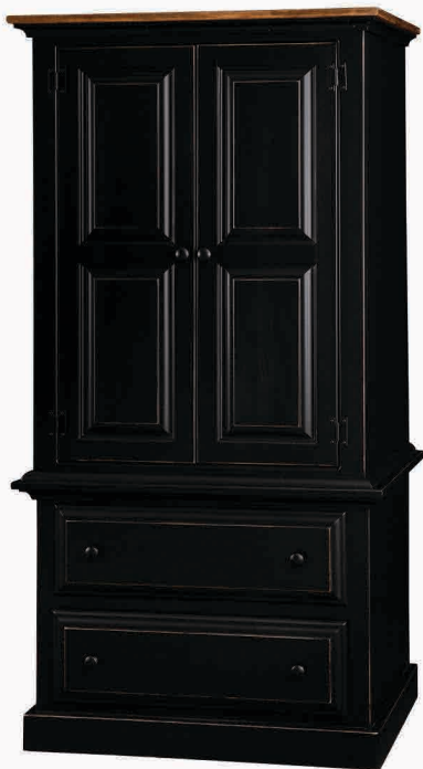
#47 Armoire on Chest 35½" w x 21" d x 67" h (2) Drawers*, Adjustable Shelves Base: Black Paint Top: Special Walnut Stain