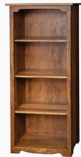
#62 Bookcase 26½" w x 13¼" d x 58" h Adjustable Shelves Special Walnut Stain