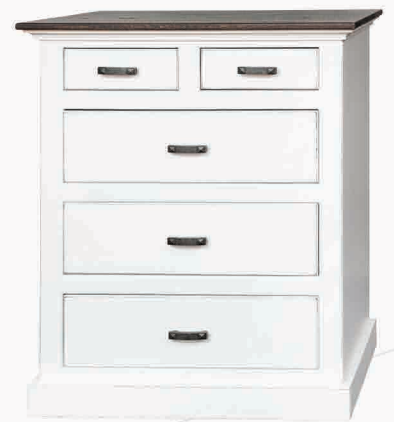
#70 Chest of Drawers 35½" w x 21" d x 41½" h (5) Flush Drawers* Amerock Hardware 44-28-WI Base: Pure White Paint Top: Ruff Oak Wood w/ Antique Slate Stain