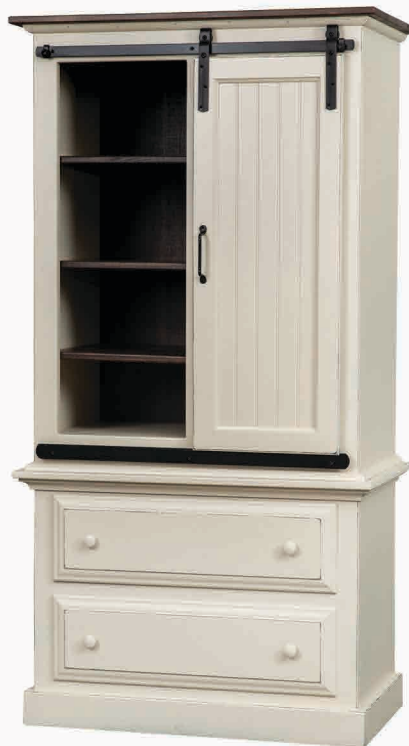
#47B Barn Door Armoire on Chest 35½" w x 21" d x 69" h (2) Drawers*, Adjustable Shelves Base: Cream Paint Top: Kona Stain