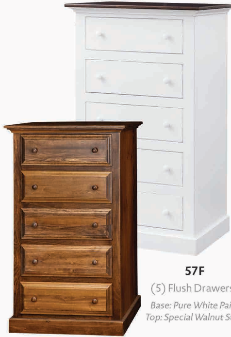
57F (5) Flush Drawers* Base: Pure White Paint Top: Special Walnut Stain