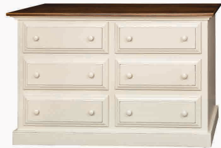
#48 Dresser 52½" w x 21" d x 34" h (6) Drawers* Base: Cream Paint Top: Special Walnut Stain