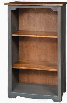
#61 Bookcase 26½" w x 13¼" d x 44" h Adjustable Shelves Base: Pewter Stain Top: Special Walnut Stain