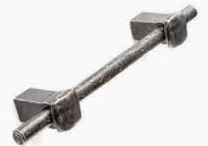
H-Select K558-S, 6" Long Swedish Iron