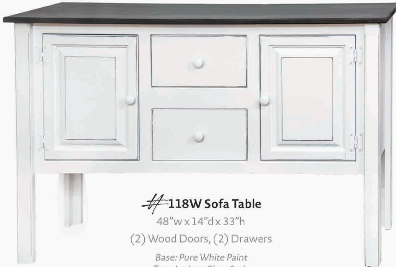
#118W Sofa Table 48" w x 14" d x 33" h (2) Wood Doors, (2) Drawers Base: Pure White Paint Top: Antique Slate Stain