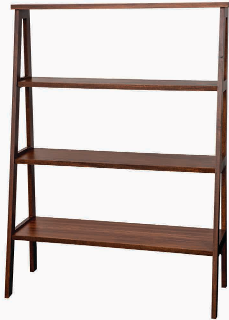
#109 Double Step Ladder Shelf, 4ft. 36½" w x 14" d x 49" h Cherry Stain