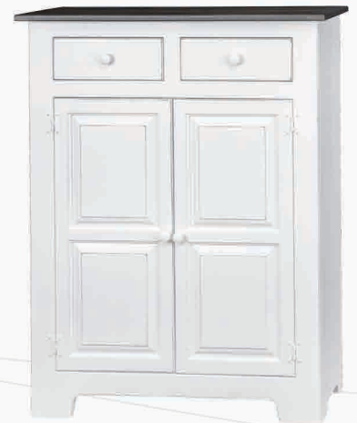
112W - Wood Doors Base: Pure White Paint Top: Antique Slate Stain