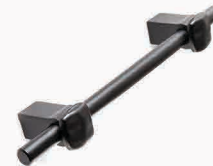
H-Select K558-BL 6" Long Black