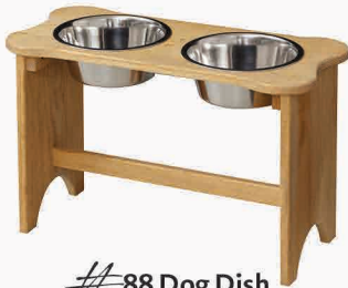
#88 Dog Dish 15" 2 Quart