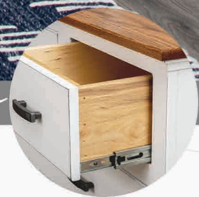
Bedroom Set Shown with Pure White Paint & Kona Stain, Barn Door Style #24B Full Barn Door Bed (see page 7), #30 Dresser (see page 6)

* 3/4 inch wood drawer boxes & full extension drawer slides