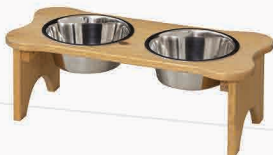
#91 Dog Dish 1 Quart