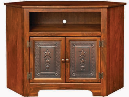
103T - Tin Doors Cherry Stain