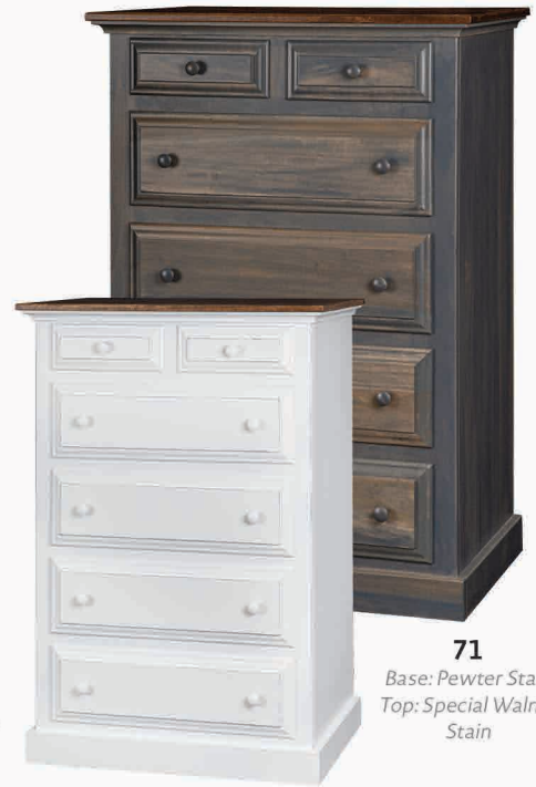
71 Base: Pewter Stain Top: Special Walnut Stain