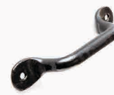
Hand Forged 3" Long Black