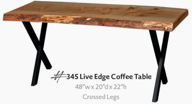
#345 Live Edge Coffee Table 48" w x 20" d x 22" h Crossed Legs Live Edge Maple