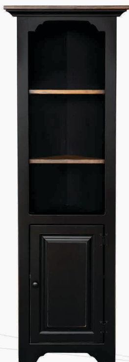
#183 Corner Cabinet 24" w x 12" d x 71" h Wood Door, Open Adjustable Shelves Base: Black Paint Top: Special Walnut Stain