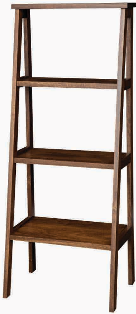
#105 Step Ladder Shelf, 4ft. 20½" w x 14" d x 49" h Special Walnut Stain