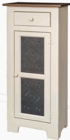
110T - Tin Door Base: Cream Paint Top: Special Walnut Stain