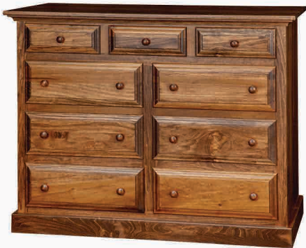
#46 Dresser 52½" w x 21" d x 40" h (9) Drawers* Special Walnut Stain