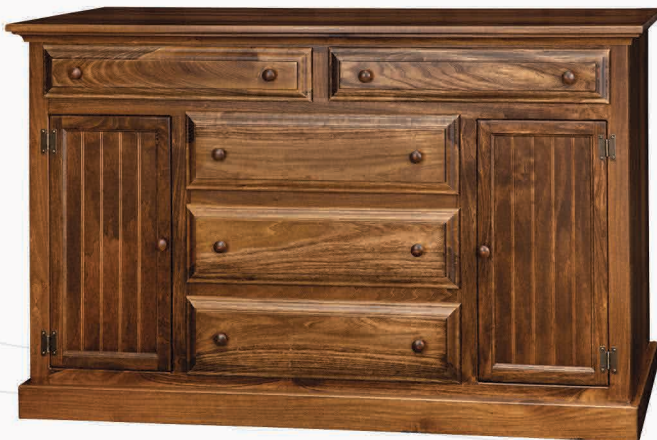
#31 Dresser Cabinet 64½" w x 21" d x 40" h (2) Doors, (5) Drawers*, Adjustable Shelves Can also be used as a server Special Walnut Stain