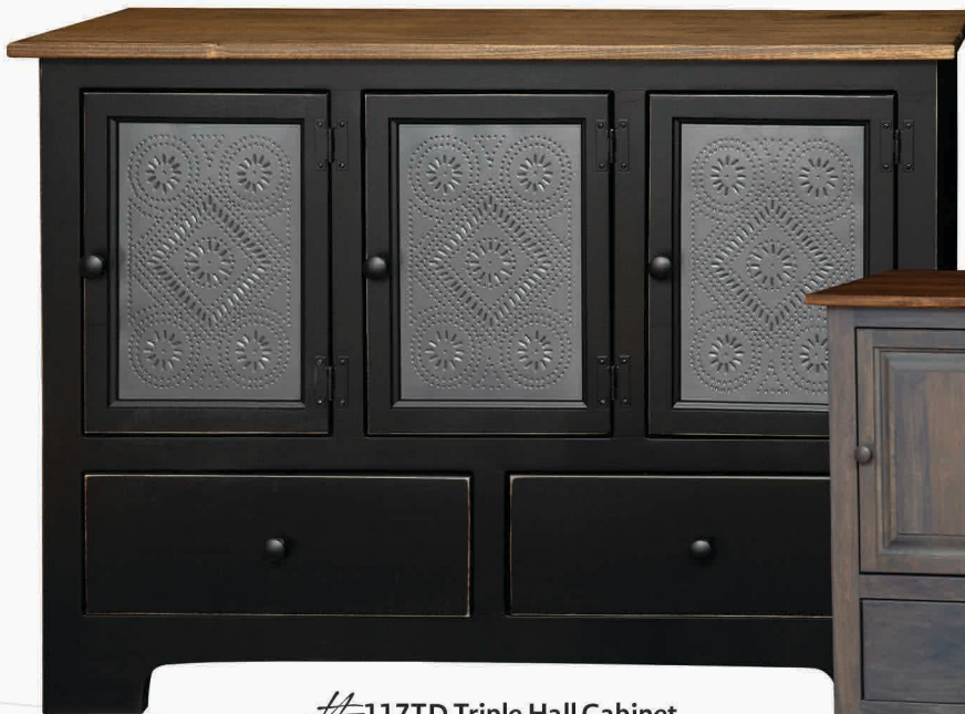
#117TD Triple Hall Cabinet 47 1/2" w x 13 1/4" d x 33" h (3) Diamond Tin Doors, (2) Drawers Base: Black Paint Top: Special Walnut Stain