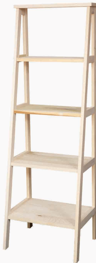
#113 Step Ladder Shelf, 5ft. 20½" w x 16" d x 60" h Unfinished