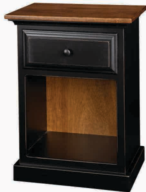
#42 Nightstand 22½" w x 14½" d x 30" h Single Drawer* Base: Black Paint Top: Special Walnut Stain