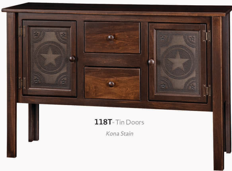
118T - Tin Doors Kona Stain