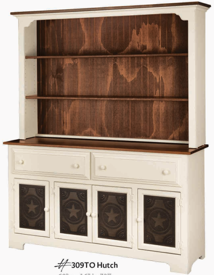
#309TO Hutch 60" w x 16" d x 73" h 5 Star Tin Doors & Open Top, Adjustable Shelves Cream Paint & Special Walnut Stain