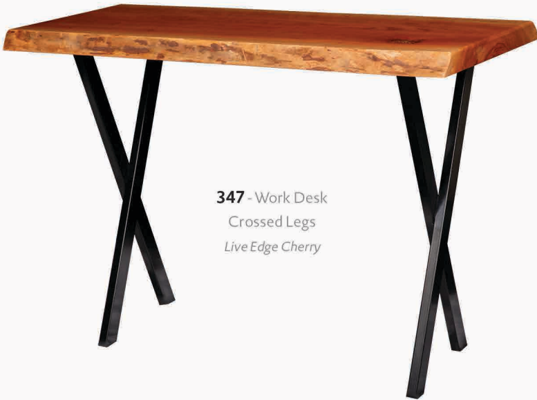
347 - Work Desk Crossed Legs Live Edge Cherry