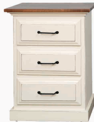
#44 Nightstand 22½" w x 14½" d x 30" h (3) Drawers* Hand Forged Handles Base: Cream Paint Top: Michael Cherry Wood w/ Cherry Stain