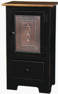
#125T Single Hall Cabinet 19 1/2" w x 13 1/4" d x 33" h Copper Stars Tin Door, Drawer Base: Black Paint Top: Special Walnut Stain