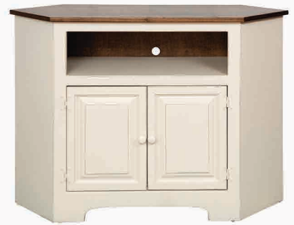
103W - Wood Doors Base: Cream Paint Top: Special Walnut Stain