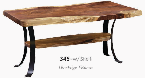
345 - w/ Shelf Live Edge Walnut