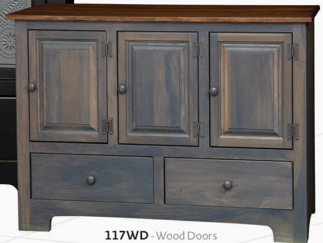
117WD - Wood Doors Base: Pewter Stain Top: Special Walnut Stain