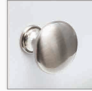
Elements S2CL3-SN Satin Nickel