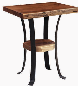
#346 Live Edge End Table 24" w x 20" d x 28" h w/ Shelf Live Edge Walnut