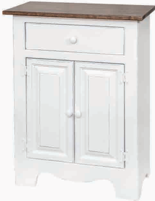
#96 Microwave Cabinet 26 1/2" w x 13 1/4" d x 34" h (1) Drawer, (2) Doors Base: Pure White Paint Top: Antique Slate Stain