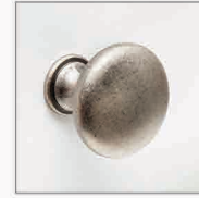
Elements S2CL3-WN Weathered Nickel