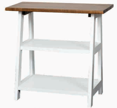
#108 End Table 25" w x 11 1/4" d x 23" h Step Ladder Style Base: Pure White Paint Top: Special Walnut Stain