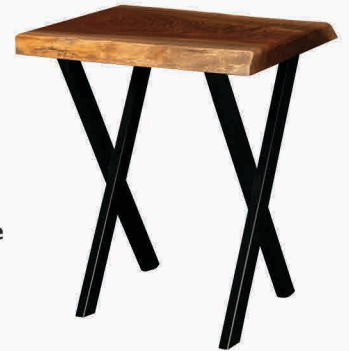
346 - Crossed Legs Live Edge Cherry