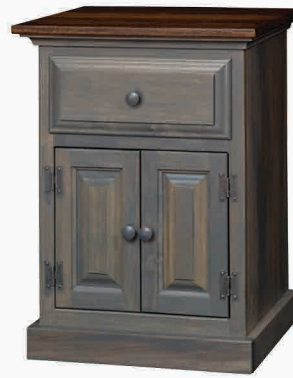
#43 Nightstand 22½" w x 14½" d x 30" h (2) Doors, Single Drawer* Base: Pewter Stain Top: Special Walnut Stain