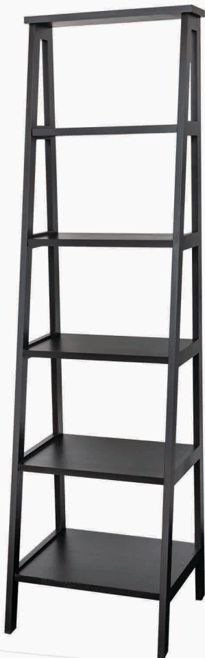
#111 Step Ladder Shelf, 6ft. 20½" w x 18" d x 72" h Black Paint