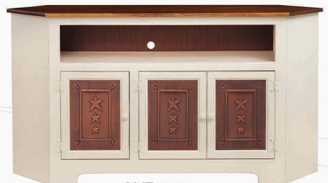
104T - Tin Doors Base: Cream Paint Top: Special Walnut Stain