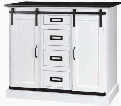
#30 Barn Door Dresser 52" w x 21" d x 43" h Adjustable Shelves Can also be used as a server Base: Pure White Paint Top: Ebony Black Stain