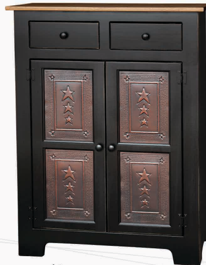
#112T Double Pie Safe 37 1/2" w x 13 1/4" d x 48" h (2) Tin Doors (2) Drawers Base: Black Paint Top: Special Walnut Stain