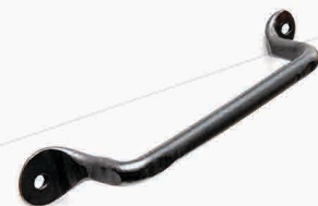
Hand Forged 5" Long Black