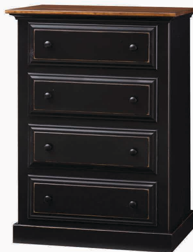
#59 Chest of Drawers 31" w x 21" d x 43" h (4) Drawers* Base: Black Paint Top: Special Walnut Stain