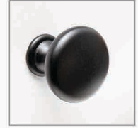
Elements 3910-MB-WN Black