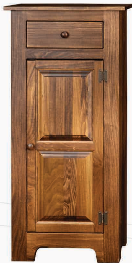
#110W Single Pie Safe 23" w x 13 1/4" d x 48" h Wood Door, Drawer Special Walnut Stain