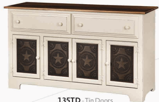
135TD - Tin Doors Base: Cream Paint Top: Special Walnut Stain