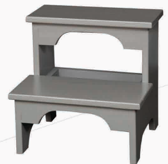
#77 Step Stool 15½" w x 14" d x 15" h, (2) Steps Gray Paint