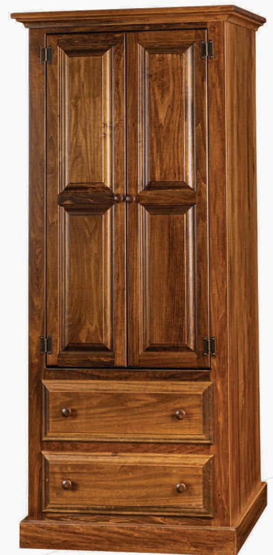
#49 Armoire on Chest 31" w x 21" d x 72" h (2) Drawers*, Adjustable Shelves Special Walnut Stain